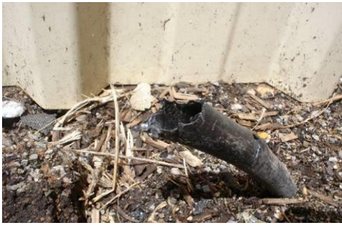
Irrigation and lawn damage caused by a pet