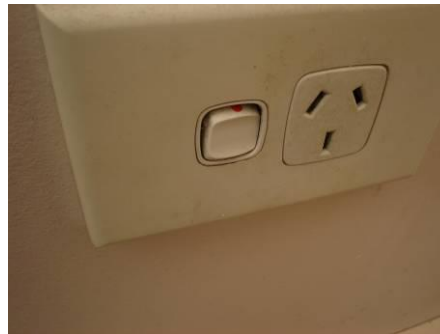
A loose switch to a power point needs repair as soon as possible