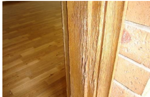
Doorway and flyscreen damage caused by a pet