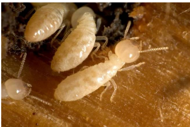
Termites are small and very destructive! (Picture not to scale)