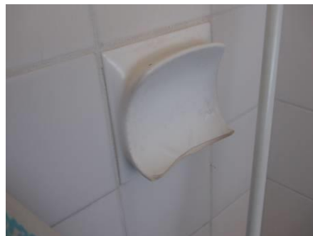
This broken soap dish in the shower could cause injury and needs to be replaced.